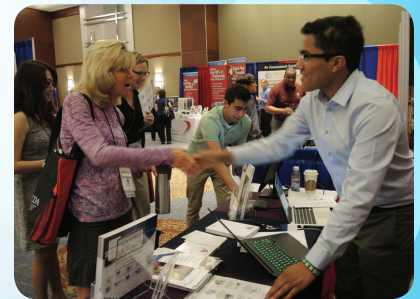
EXHIBIT HALL SCHEDULE